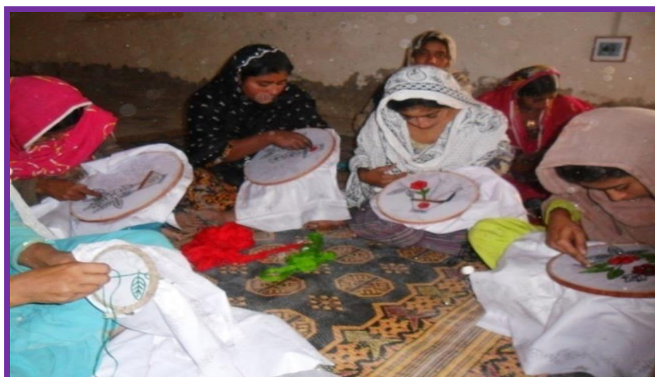
Women & Girls Friendly Spaces