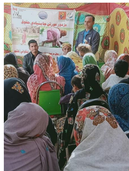
Awareness sessions with women's labour Rights

The organization believes in a feasible, knowledgeable, and energetic rural community. SSSWA is accountable to those who support it and those whom it works for as we believe in transparency. Transparency is not the same as looking straight through a building: it's not just a physical idea but also an intellectual one. Similarly, gender equality, supremacy of law, political participation, civil society, and transparency are among the indispensable elements that are the imperatives of democratization.