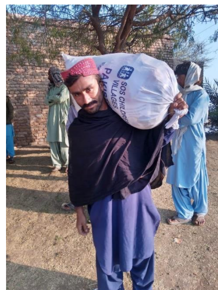
Distribution of relief goods to flood-affected population